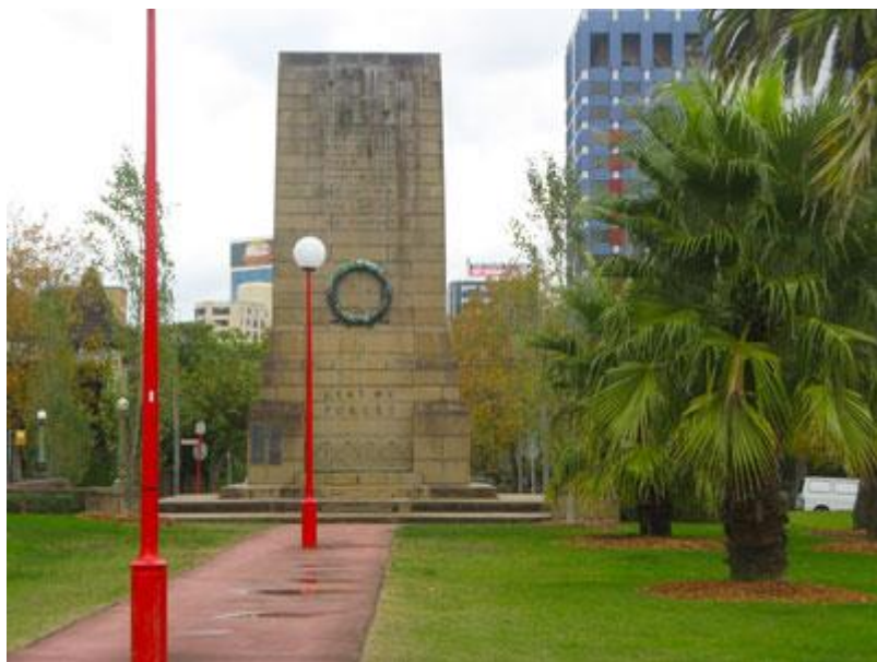
North Sydney War Memorial