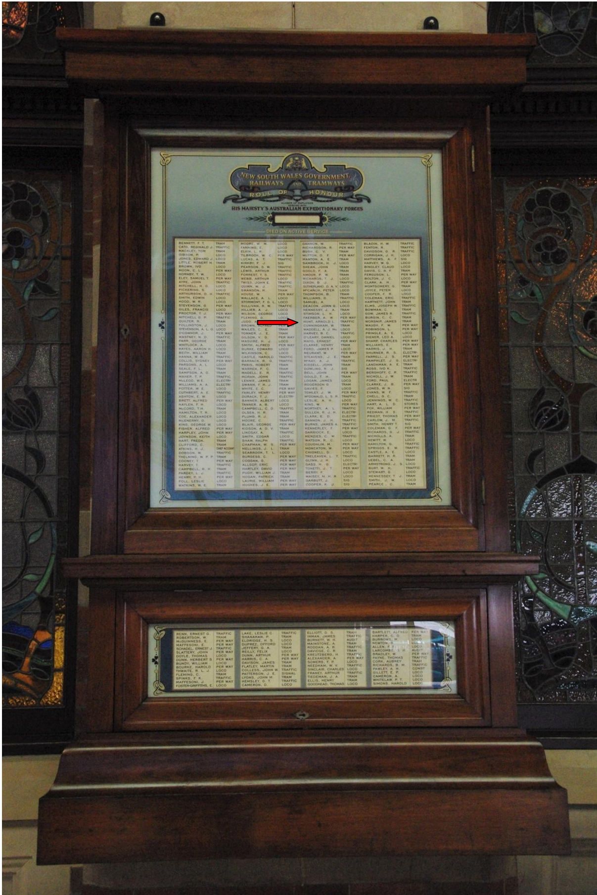
NSW Government Railways and Tramways Rolls of Honour