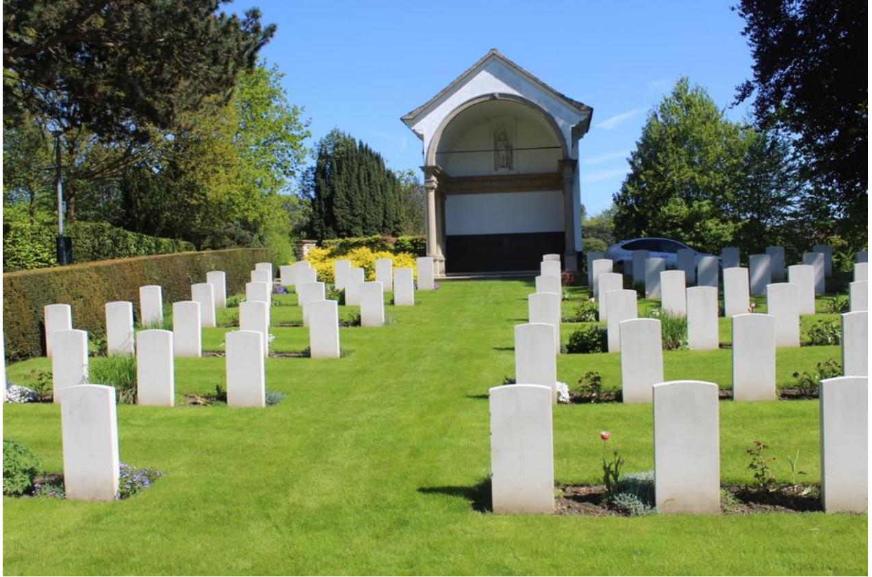
War Memorial Shelter in background