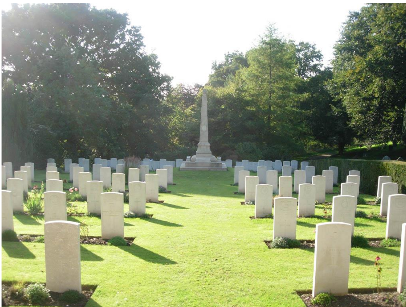
Ipswich Old Cemetery, Suffolk

Ipswich Old Cemetery, Suffolk contains around 366 Casualties from both World Wars. Around 265 War Graves are from World War 1. There are 4 Australian War Graves from World War 1 & 1 from World War 2.